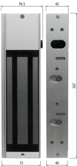
All dimensions in mm