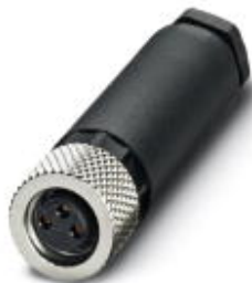
Connector, Universal, 3-position, Socket straight M8, A-coded, Screw connection, knurl material: Nickel-plated brass, external cable diameter 3.5 mm ... 5 mm

Please be informed that the data shown in this PDF Document is generated from our Online Catalog. Please find the complete data in the user's documentation. Our General Terms of Use for Downloads are valid ( http://phoenixcontact.com/download )