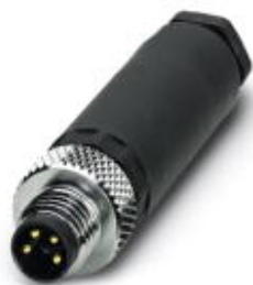
Connector, Universal, 4-position, Plug straight M8, A-coded, Screw connection, knurl material: Nickel-plated brass, external cable diameter 3.5 mm ... 5 mm

Please be informed that the data shown in this PDF Document is generated from our Online Catalog. Please find the complete data in the user's documentation. Our General Terms of Use for Downloads are valid ( http://phoenixcontact.com/download )