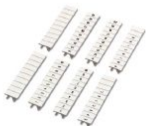
Zack marker strip, 10-section, vertically labeled with the consecutive numbers: 101 ... 110, white, width: 5 mm

Please be informed that the data shown in this PDF Document is generated from our Online Catalog. Please find the complete data in the user's documentation. Our General Terms of Use for Downloads are valid ( http://phoenixcontact.com/download )