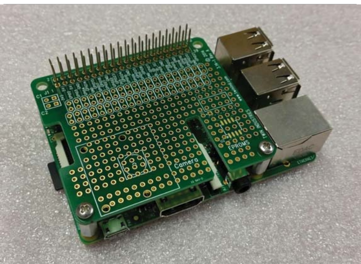
Part#3.141-1 (with accessories) Raspberry Pi B+ sold separately