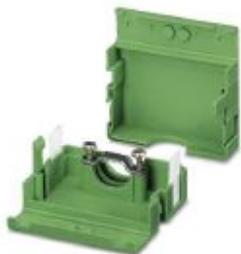
Cable housing, pitch: 0 mm, number of positions: 5, color: green

Please be informed that the data shown in this PDF Document is generated from our Online Catalog. Please find the complete data in the user's documentation. Our General Terms of Use for Downloads are valid ( http://phoenixcontact.com/download )