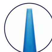
Standard Single Tapered UV Blocking