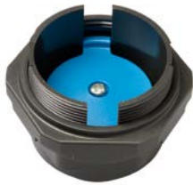
Photo: Inside view