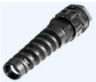
M - P