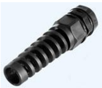
MGA - P