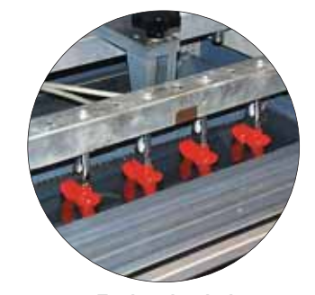
Testing electrical insulation