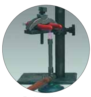
Testing resistance to fire