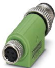
Adapter, 4-position, Plug straight M12, A-coded, on Socket straight M8, A-coded

Please be informed that the data shown in this PDF Document is generated from our Online Catalog. Please find the complete data in the user's documentation. Our General Terms of Use for Downloads are valid ( http://phoenixcontact.com/download )