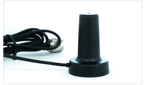
Image does not reflect the actual size of the antenna

Ordering Part #: 100-00044-01 (TNC) Ordering Part #: 100-00044-02 (SMA) Ordering Part #: 100-00044-03 (SMB) Ordering Part #: 100-00044-04 (MCX)