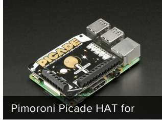
Pimoroni Picade HAT for