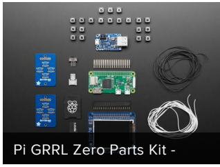
Pi GRRR Zero Parts Kit -