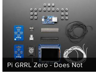
Pi GRRR Zero - Does Not