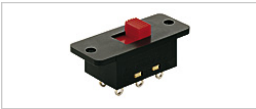
Similar to original product