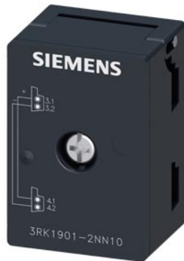
AS-Interface distributor compact for AS-i profile cable IP 67/68/69K, max. 8 A