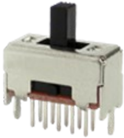
Image shown represents the product series and may not indicate the actual part number