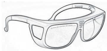
38 Large Adjustable