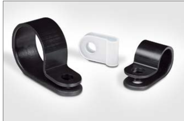
P-Clamps H1P - H18P in different dimensions.