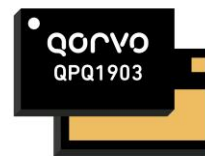
3 Pad 1.7 x 1.1 mm Laminate Package

Using common module packaging techniques to achieve the industry standard footprint while negating as many external passive placements to help end users ease of integration into their circuits.