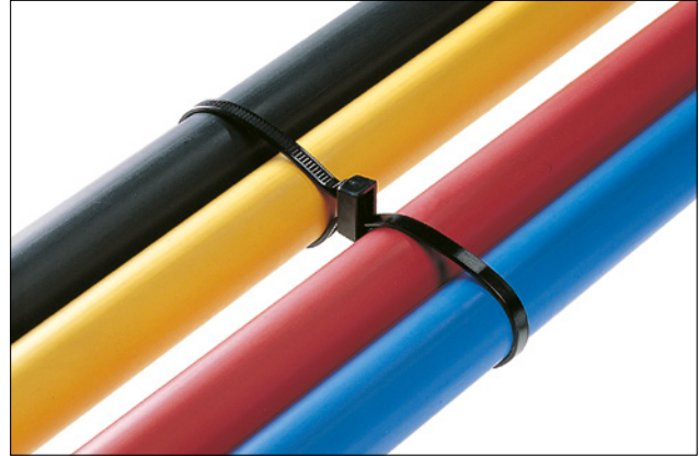
Parallel routing of two cable bundles using DH-Series. The double head creates an inside and an outside serrated loop.