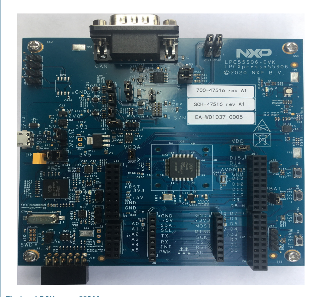
Fig 1. LPCXpresso55S06

See https://www.nxp.com/demoboard/LPC55S06-EVK for more information on these boards, including tutorial videos, development software and board hardware design files. The abbreviation LPC55S0x is used to collectively refer to the LPC55S0x/LPC550x family device on the board.