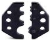
Spare die for CRIMPFOX-RC 10

Replacement die - CRIMPFOX-RC 10/DIE - 1212062