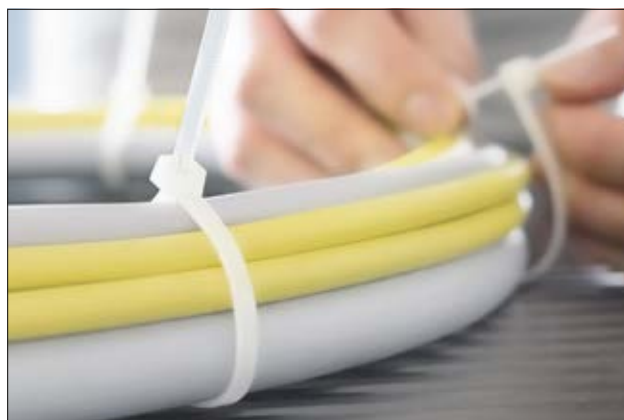
RELK releasable cable ties for temporary bundling.