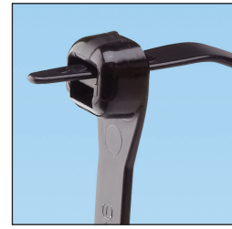
Tapered Tip with Aggressive Grips