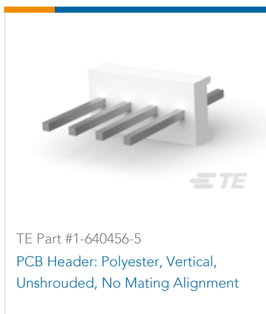
TE Part #1-640456-5 PCB Header: Polyester, Vertical, Unshrouded, No Mating Alignment