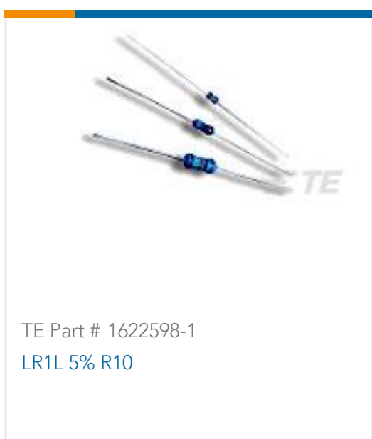
TE Part # 1622598-1 LR1L 5% R10