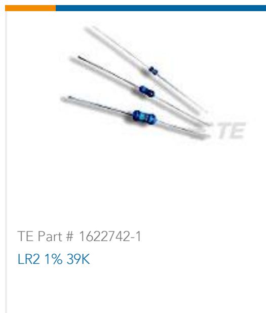
TE Part # 1622742-1 LR2 1% 39K