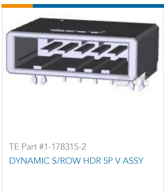
TE Part #1-178315-2 DYNAMIC S/ROW HDR 5P V ASSY