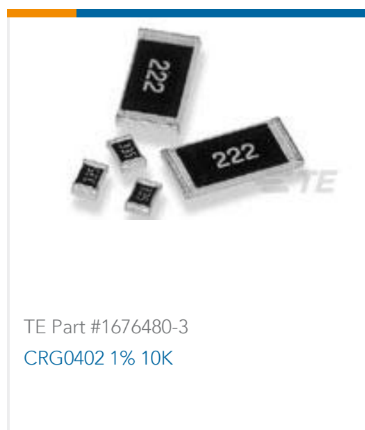
TE Part #1676480-3 CRG0402 1% 10K