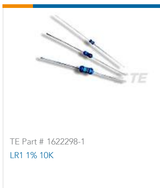
TE Part # 1622298-1 LR1 1% 10K