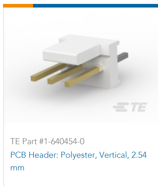
TE Part #1-640454-0 PCB Header: Polyester, Vertical, 2.54 mm