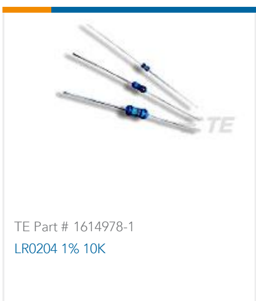
TE Part # 1614978-1 LR0204 1% 10K