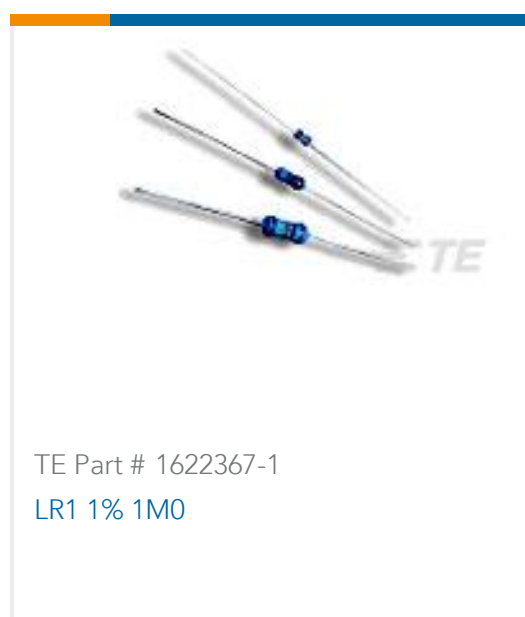
TE Part # 1622367-1 LR1 1% 1M0