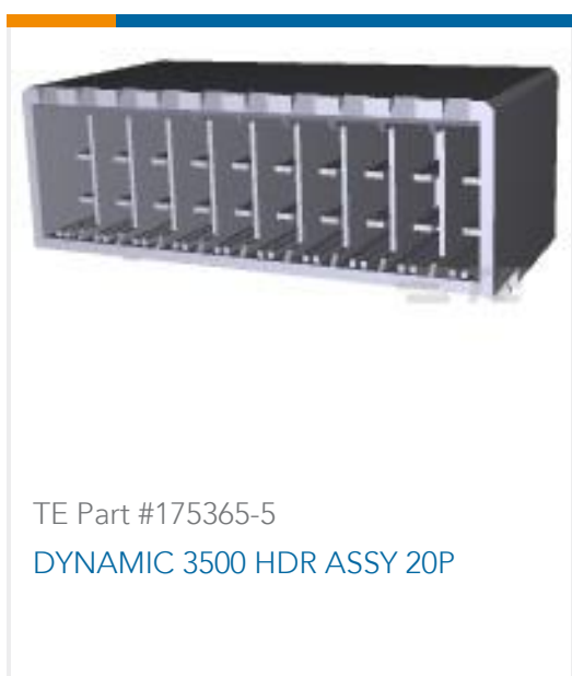
TE Part #175365-5 DYNAMIC 3500 HDR ASSY 20P