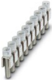
Fixed bridge, pitch: 8 mm, number of positions: 10, color: silver

Please be informed that the data shown in this PDF Document is generated from our Online Catalog. Please find the complete data in the user's documentation. Our General Terms of Use for Downloads are valid ( http://phoenixcontact.com/download )