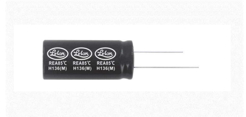
Sleeve & Marking Color: Blue & Black