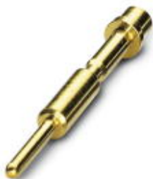
Crimp contact, turned, Single contact, contact diameter: 1 mm, crimp range: 0.14 mm 2 ... 0.5 mm 2

Please be informed that the data shown in this PDF Document is generated from our Online Catalog. Please find the complete data in the user's documentation. Our General Terms of Use for Downloads are valid ( http://phoenixcontact.com/download )