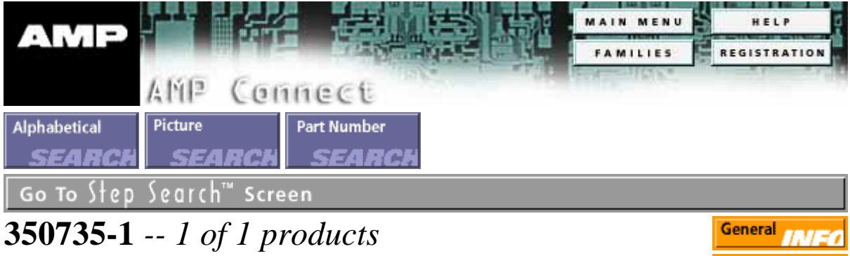
Soft Shell Connectors Soft Shell - Housings, Test Connectors and IDC Connectors