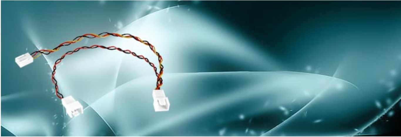
3pin fan splitter cable Enables connecting 2 fans to single fan header