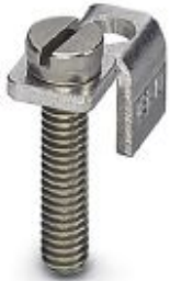
Chain bridge, pitch: 10 mm, number of positions: 1, color: silver

Please be informed that the data shown in this PDF Document is generated from our Online Catalog. Please find the complete data in the user's documentation. Our General Terms of Use for Downloads are valid ( http://phoenixcontact.com/download )