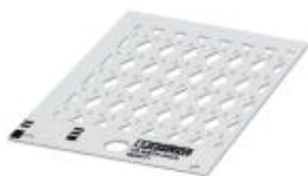
The figure shows the US-WMTB (24x5) version

Cable marker, Card, white, Unlabeled, Can be labeled with: THERMOMARK CARD PLUS, THERMOMARK CARD, Mounting type: Thread on, Cable diameter: >13 mm, Lettering field: 29 x 8 mm