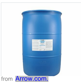
985M Soldering Flux