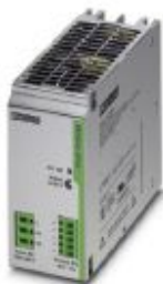
Primary-switched TRIO POWER power supply for DIN rail mounting, input: 1-phase, output: 48 V DC/5 A

Please be informed that the data shown in this PDF Document is generated from our Online Catalog. Please find the complete data in the user's documentation. Our General Terms of Use for Downloads are valid ( http://phoenixcontact.com/download )