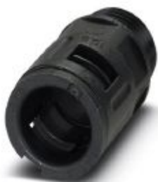
Cable gland, Pg thread, IP66 protection, straight

Please be informed that the data shown in this PDF Document is generated from our Online Catalog. Please find the complete data in the user's documentation. Our General Terms of Use for Downloads are valid ( http://phoenixcontact.com/download )