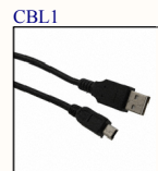
USB-A Male to Mini USB-B Male