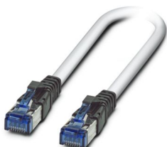
Patch cable, CAT6, preassembled, 20.0 m

https://www.phoenixcontact.com/us/products/2891576