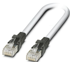
Patch cable, CAT5, assembled, 5 m

https://www.phoenixcontact.com/us/products/2832580