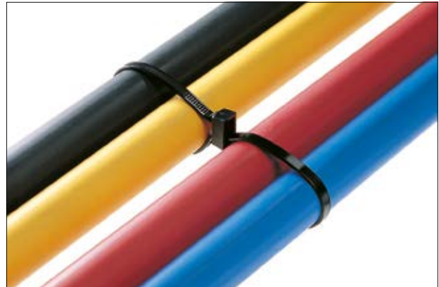
Parallel routing of two cable bundles using DH-Series. The double head creates an inside and an outside serrated loop.