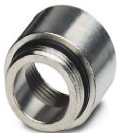
NPT adapter, IP68, up to 5 bar, incl. O-ring seal, M20 to 1/2"

Please be informed that the data shown in this PDF Document is generated from our Online Catalog. Please find the complete data in the user's documentation. Our General Terms of Use for Downloads are valid ( http://phoenixcontact.com/download )