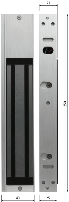
All dimensions in mm