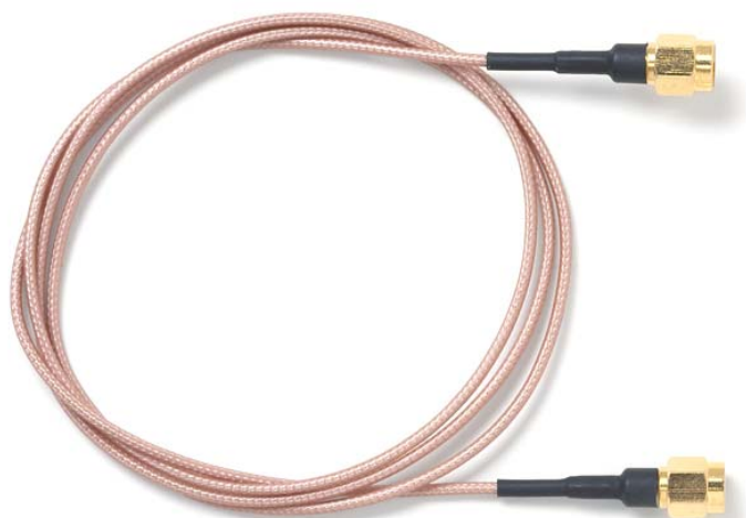
Model 4846-UU SMA Plug to SMA Plug, RG178B/U

Small size, and durability for confident connections