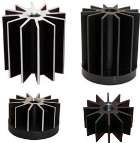
60 mm Diameter & 100 mm Diameter Heat Sinks