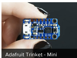
Adafruit Trinket - Mini