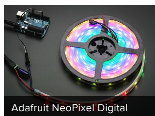
Adafruit NeoPixel Digital