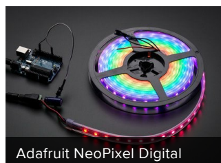
Adafruit NeoPixel Digital