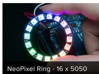
NeoPixel Ring - 16 x 5050