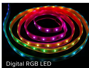
Digital RGB LED