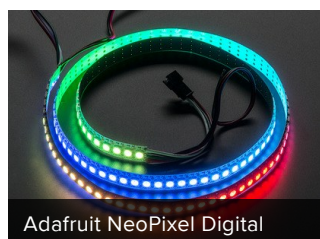
Adafruit NeoPixel Digital