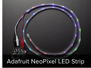
Adafruit NeoPixel LED Strip