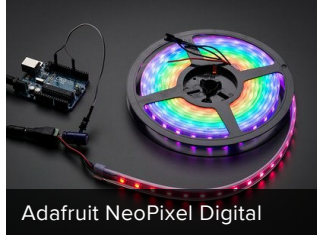
Adafruit NeoPixel Digital