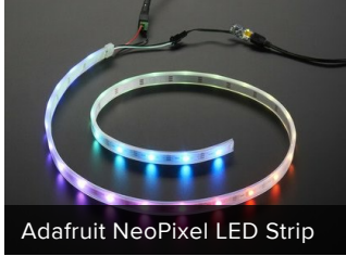
Adafruit NeoPixel LED Strip