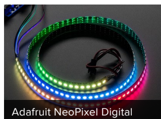
Adafruit NeoPixel Digital