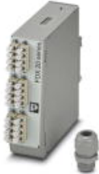
DIN rail splice box, fully mounted ready to splice, for 12x LC duplex (OM4)

Please be informed that the data shown in this PDF Document is generated from our Online Catalog. Please find the complete data in the user's documentation. Our General Terms of Use for Downloads are valid ( http://phoenixcontact.com/download )