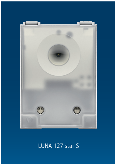
LUNA 127 star S