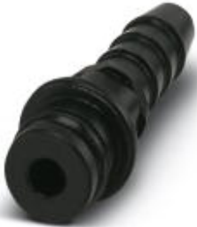
Pneumatic pin, for HC-M-PN3 module, internal hose diameter of 4.0 mm

Please be informed that the data shown in this PDF Document is generated from our Online Catalog. Please find the complete data in the user's documentation. Our General Terms of Use for Downloads are valid ( http://phoenixcontact.com/download )