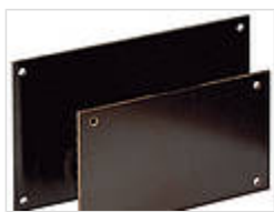
Mounting panel, laminated paper

25001700 E-SV For E 435, E 440 VL, E 445, E 450 VL, E 460, E 470