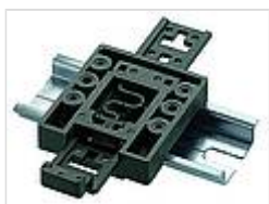
Universal DIN rail holder TSH 35, polyamide

22009000 GF Polyurethane, 65-75 Shore Black