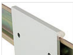
Metal top hat rail adapter for DIN rail DIN EN 60715 TH 35

22035000 TSH 35 Black, similar to RAL 9005