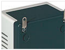
Wall brackets, nickel-plated sheet steel