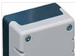
Lid assembly kit from above