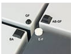
Universal rubber feet for stability of the enclosures on all surfaces

34035050 TSH 35 AL - 50 Width 50 mm, natural colour anodised 34035100 TSH 35 AL - 100 Width 100 mm, natural colour anodised