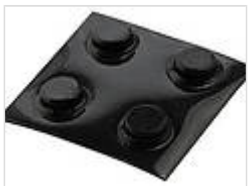
Rubber feet, self-adhesive

22009000 GF Polyurethane, 65-75 Shore Black