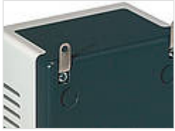
Wall brackets, nickel-plated sheet steel