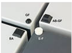
Universal rubber feet for stability of the enclosures on all surfaces

34035050 TSH 35 AL - 50 Width 50 mm, natural colour anodised 34035100 TSH 35 AL - 100 Width 100 mm, natural colour anodised