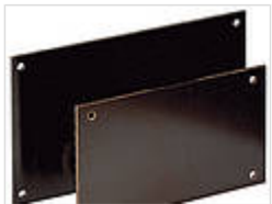
Mounting panel, laminated paper

25001700 E-SV For E 435, E 440 VL, E 445, E 450 VL, E 460, E 470