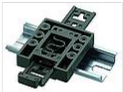
Universal DIN rail holder TSH 35, polyamide

22009000 GF Polyurethane, 65-75 Shore Black