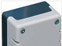
Lid assembly kit from above