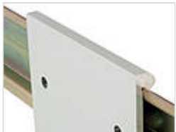
Metal top hat rail adapter for DIN rail DIN EN 60715 TH 35

22035000 TSH 35 Black, similar to RAL 9005