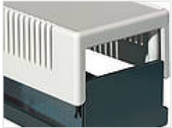
Quick-release fastener, polyamide

25001700 E-SV For E 435, E 440 VL, E 445, E 450 VL, E 460, E 470