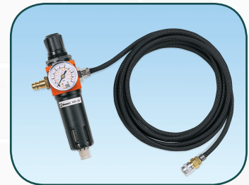
Pneumatic Tool Accessories