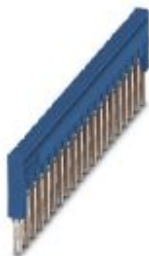
Plug-in bridge, pitch: 3.5 mm, number of positions: 20, color: blue

Please be informed that the data shown in this PDF Document is generated from our Online Catalog. Please find the complete data in the user's documentation. Our General Terms of Use for Downloads are valid ( http://phoenixcontact.com/download )